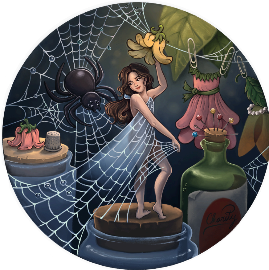
Spider Circle. 2024 Digital

I like making practical art. Perhaps another way to say it is I like making art that people can take with them, whether it's a pair of earrings, a sticker, or a logo design on a flyer. I also make work that tells stories, another thing that stays with people. I see art as a form of communication, and in combination with my eye for design makes me thrive in graphic design and visual storytelling. My artistic practice is fueled by my inspiration found in our connection with others, usually animals or everyday objects and experiences.