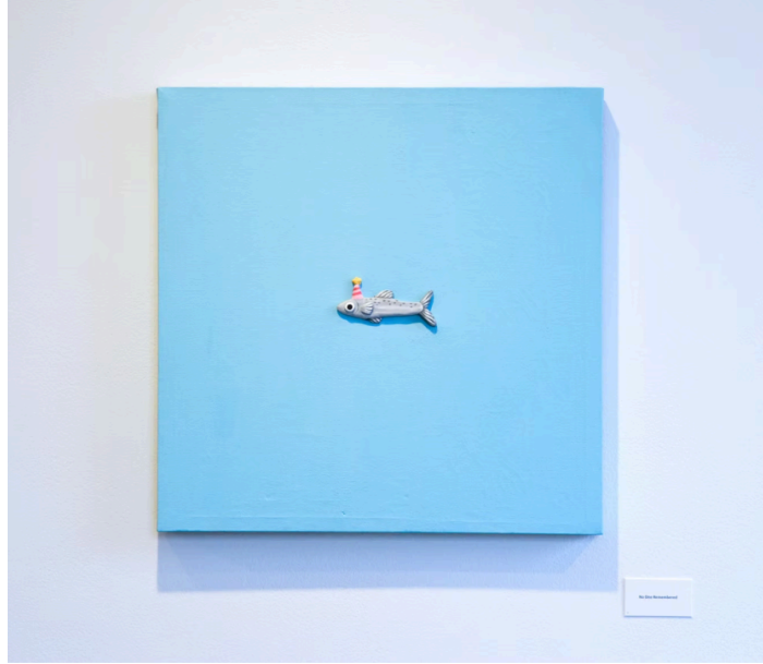
No One Remembered. 2025 Acrylic and Clay on Canvas 25" x 25"