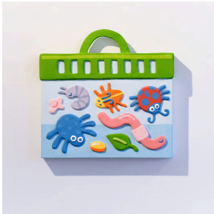
Bugs. 2024 Acrylic and Clay on Canvas 11" x 14"